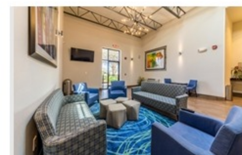
Former Hampton Inn reopens as Allentown Park Hotel after $3M renovations