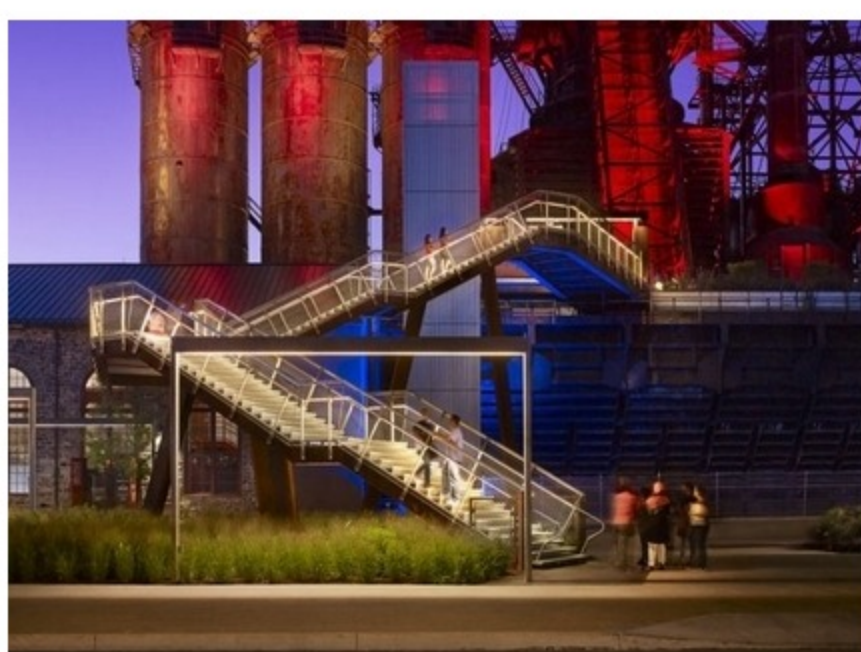
The SteelStacks Arts and Cultural Campus in Bethlehem has received the gold medal in the Rudy Bruner Award for Urban Excellence.